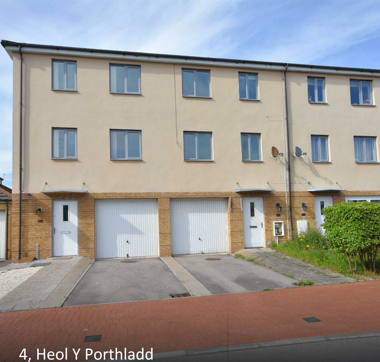
4, Heol Y Porthladd Barry, CF63 4AP